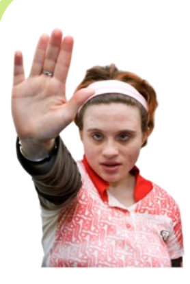
Be polite but firm. Say no thank you and shut the door.