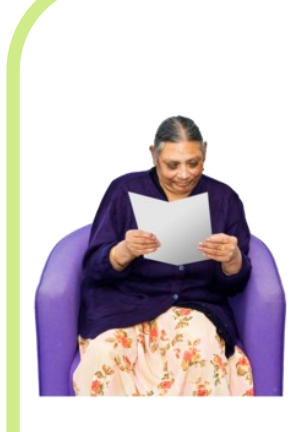
Don't believe all leaflets that come through the door. They may be getting you to have bad work done.

Remember things about them in case you have to report them.