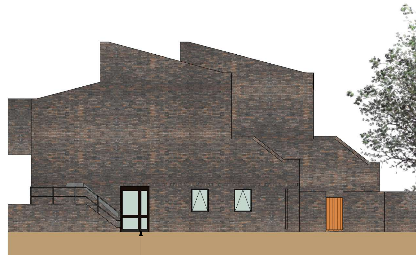
Proposed Elevation - West 1 : 100