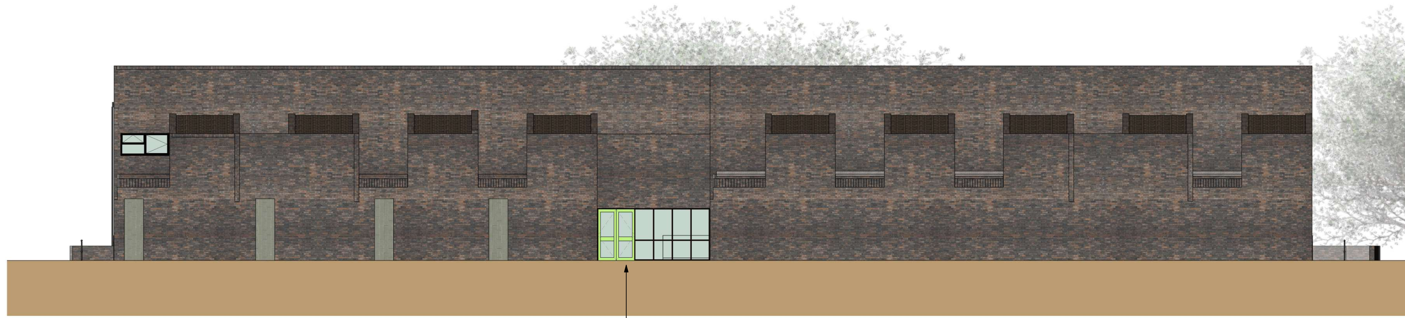
Proposed Elevation - North 1 : 100