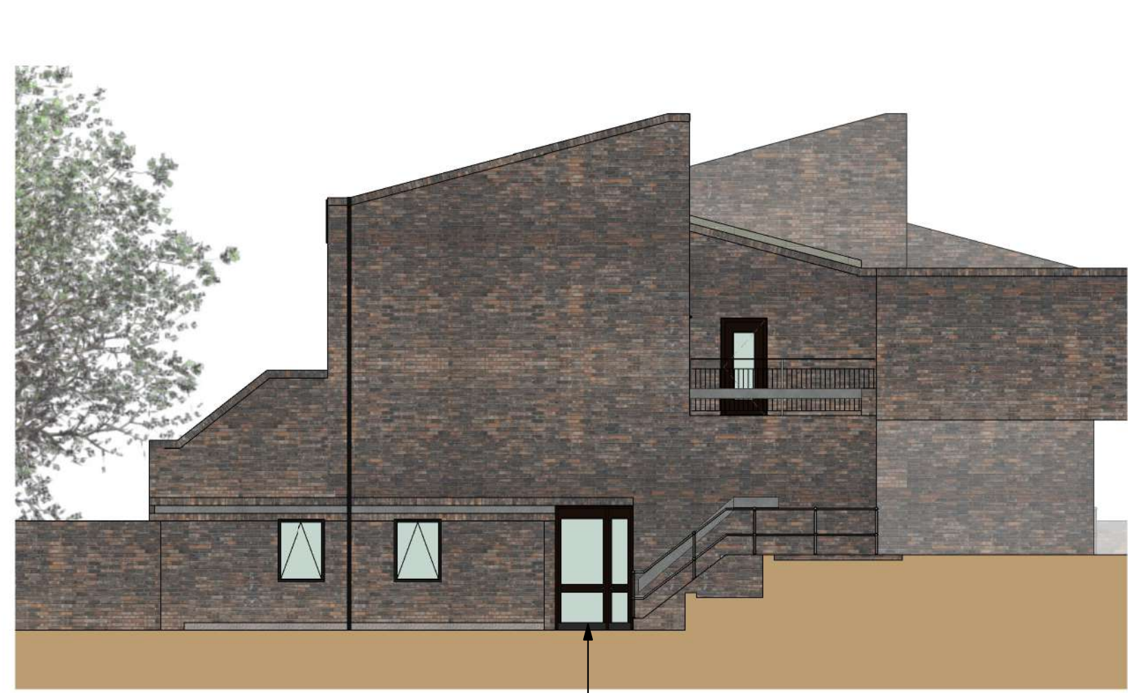
Proposed Elevation - East 1 : 100