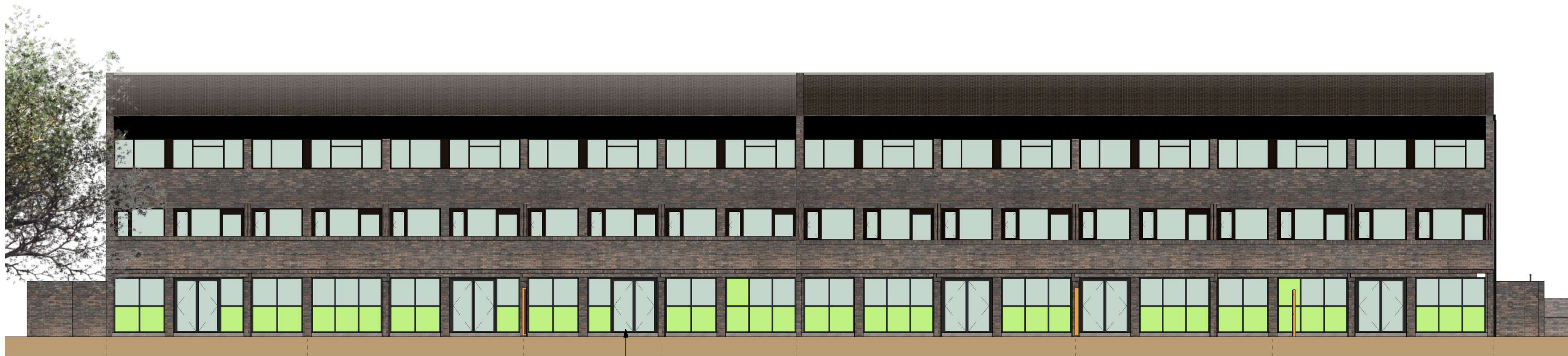
Proposed Elevation - South 1 : 100