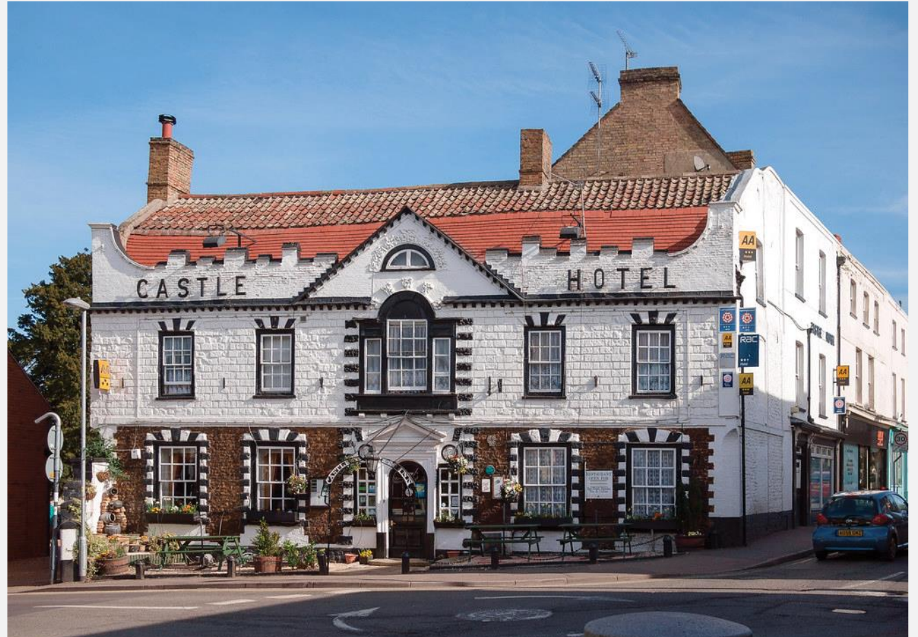
The Castle Hotel, Downham Market